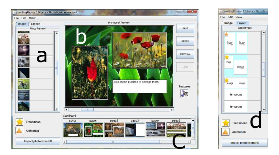
Figure 1: User interface of the prototype smilingPhotos. The "Layout" panel (d) is hidden under the pictures preview panel.

If the user saves the book, smilingPhotos creates two files: a SMIL file describing the resulting multimedia presentation and an XML file describing the structure of the document without the temporal information. This second file is used to re-open the book for further elaboration, e. g., to print it. We must say that a standard format for printing does not exist, but each photo printing service defines its own format, usually using XML language. For this reason, smilingPho tos does not export a particular format, but the use of XML languages (SMIL is an XML language too) allows for the easy translation to any existing format by defining an appropriate XSLT transformation.