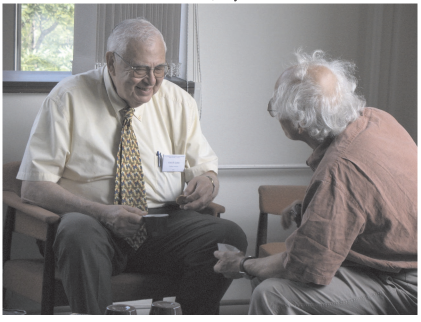
Dedicated to the authors' mothers who both were born in Latvia and grew up there nearly a century ago.