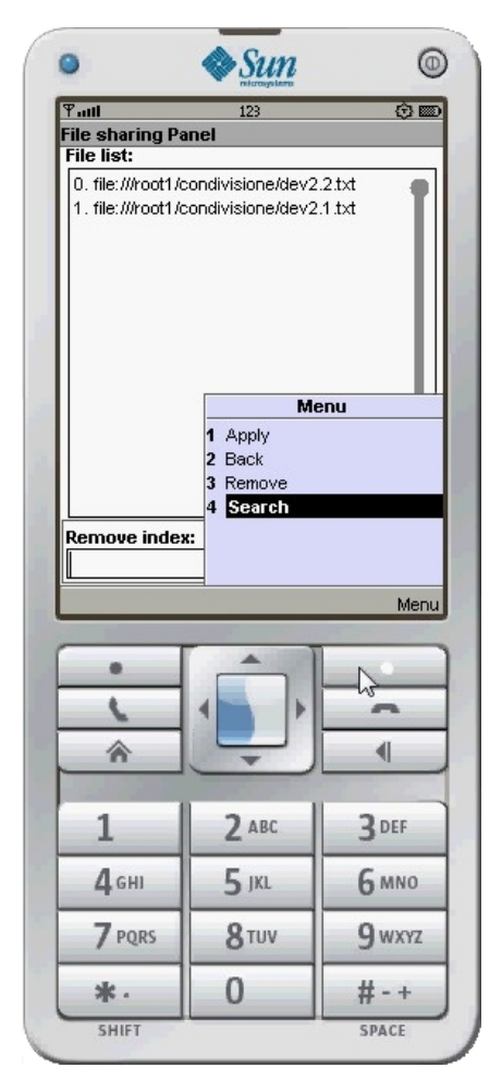
Figure 2. P2PBluetooth running on the Java Wireless Toolkit emulator.

As an example, Fig. 2 shows P2PBluetooth running on the Java Wireless Toolkit emulator. In particular, the user is selecting the "search" option from the menu, while, on the background, files currently available for download are visible. For the sake of conciseness, we have try to provide in this paper as many useful details as possible (given the limitation on the number of pages). However, the interested reader may find a video of a demo available online [6].